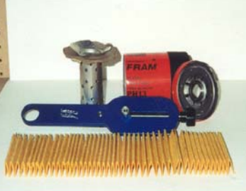
9. Cutting filter by hand.